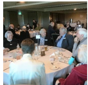
Some Ladies Luncheon photos